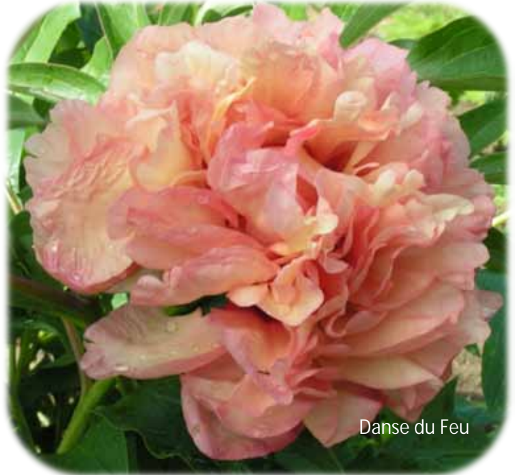
Danse du Feu

"Danse du Feu" PPAF, PBR, or « Dance of Fire » is a name that perfectly represents the character of the bloom. A warm bright yellow-orange color on a full double bloom. As with all of our new cultivars, the large number of primary and secondary blooms extends the enjoyment of their fantastic display over a longer period than traditional peonies.