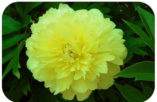
YELLOW DOODLE DANDY

Semi-double to double blooms are a deep pink with cream undertones that come to the surface as the flowers mature. The attractive center contains a tight circle of stamens. This is a vigorous grower.