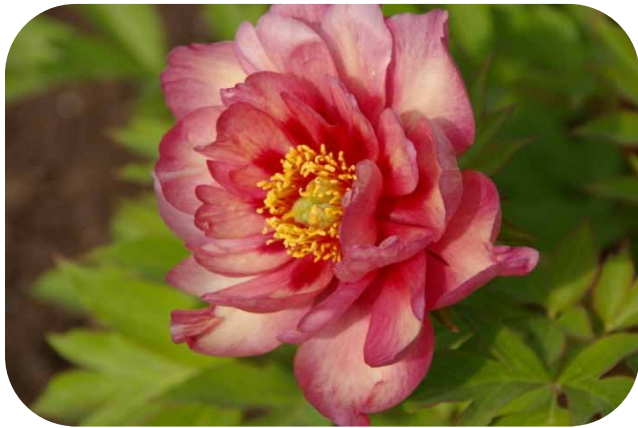
MAGICAL MYSTERY TOUR

Gorgeous, semi-double to double flowers are a cream & pink blend that is very pink when first open, but fades to a beautiful creamy white with a lavender pink picotee after several days in the bright sun.