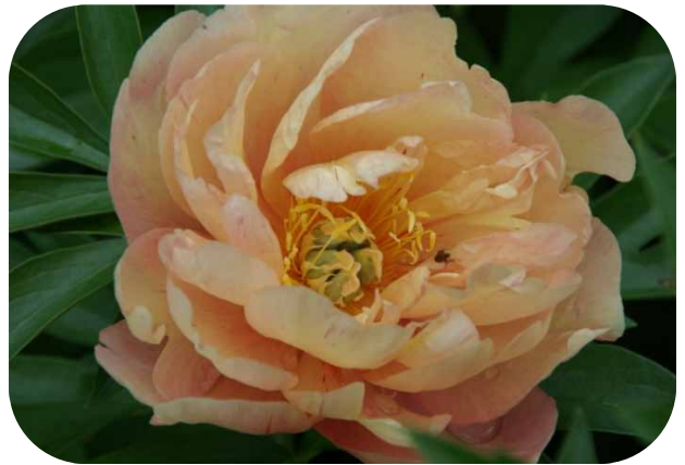
SINGING IN THE RAIN

Single to semi-double sulphur yellow flowers with red tipped carpels and red flares are held well above the dark green foliage. Vigorous and floriferous, the long stems also make good cut flowers.