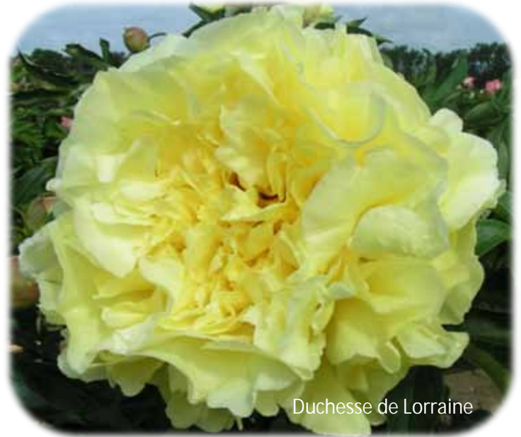
Duchesse de Lorraine

"Duchesse de Lorraine" Plant Patent #26,907, PBR, is named for the Lorraine region of France, home of renowned breeder Victor Lemoine. This is the first fully double, yellow Itoh with an enticing fragrance as an added bonus. The bomb-type bloom may have 120 to 150 petals, far outnumbering even Bartzella. Could this be the yellow cut flower we have all been waiting for?