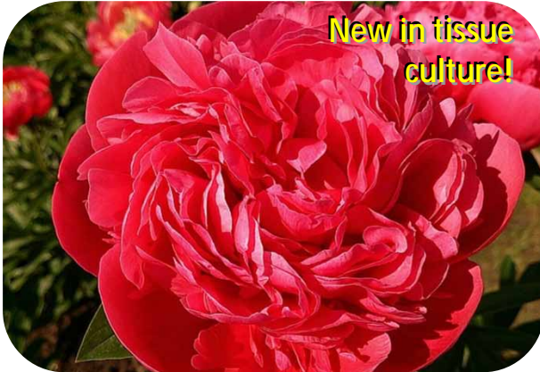
GLOWING RASPBERRY ROSE

An extremely strong stemmed double bomb peony of raspberry-rose, with a darker coloured petal base. The flowers are held well over the dark green foliage. Excellent picking.