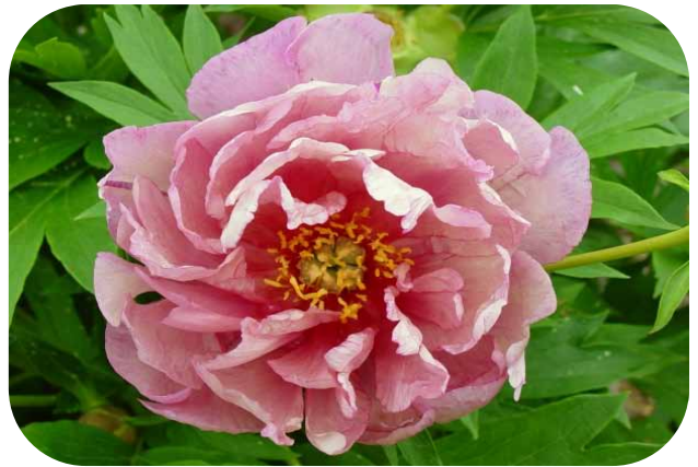
PINK DOUBLE DANDY

The splendor of this variety resides in the vivid dark red flares contrasted by creamy rose to pale yellow petals and white stigmas. This is a more compact bushy plant than most of the other Itoh.