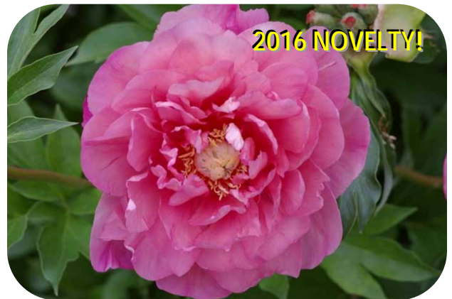
STRAWBERRY CRÈME BRÛLÉE

This beautiful deep red variety was previously only known as 'red double seedling'. We have had success with this one in tissue culture and thought that it was high time to give it a name.